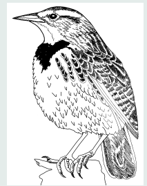
Illustration: Barbara Gleason

Like many other members of the Blackbird Family, Western Meadowlark males usually have two mates concurrently. These females are on separate nests within the territory of the male who defends them. Meadowlarks forage almost exclusively on the ground where they seek grains and seeds as well as a large variety of beetles, grasshoppers and other insects. The bright yellow breast, crossed by a broad black "V" makes this a striking bird to see but this pattern, combined with the brown streaks across the back, makes this bird difficult to see in a grassy field. While you may not see the birds, you can still hear their glorious songs ringing across the grasses as you enjoy our wetlands.